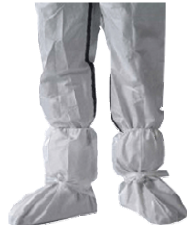
One size Overboot