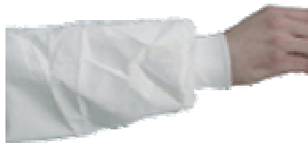
Oversleeve with knitted cuff (elasticated version available)