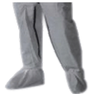
One size Overshoe