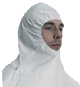
One size hood

Macrobond™ accessories can be used to protect the wearer from his environment or the environment from the wearer. The range has been designed to allow for maximum comfort and wearability